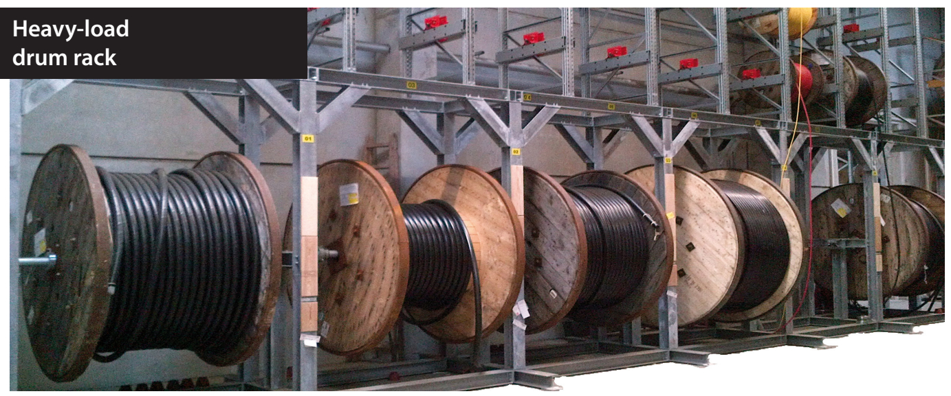
Fig. 1 ABROL heavy-load drum rack combined with LAGROL drum rack