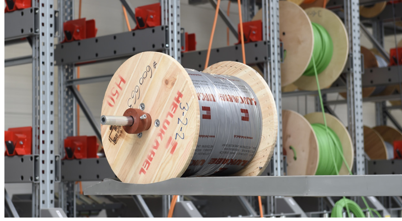
Fig. 2 TROMPLAT 1000 example of storing the drum into a Kabelmat LAGROL rack