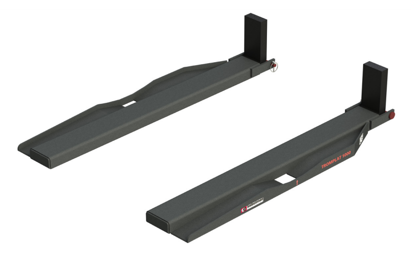
Fig. 1 TROMPLAT 1000