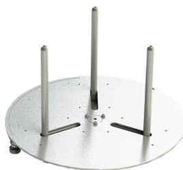
Fig. 3 RINGFIX 480 unwinding plate