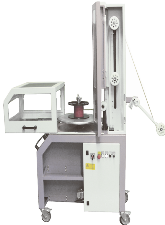
Fig. 1 SPULFIX 480 with open cover

Perfect complement to processing machines