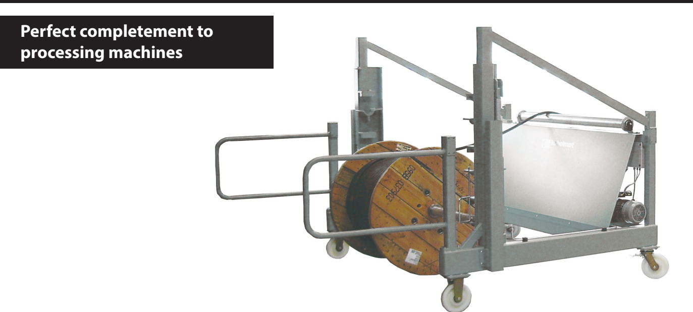
Fig. 1 TROMROL 2500