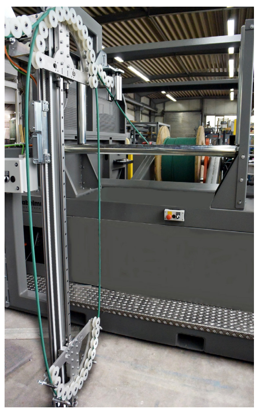
Fig. 2 ACUMATIC: material accumulator / dancer for controlling and synchronization of the drive of the drum. Necessary for tension sensitive winding goods.