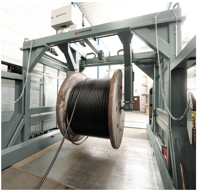
Fig. 3 PORTROL 2500 AWB