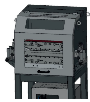
Fig. 2: AUTOFEED 500-90