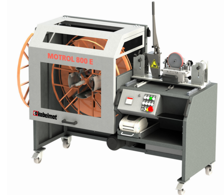
Fig. 3 MOTROL 800 EASY

This winder is also available with conformity assessment.