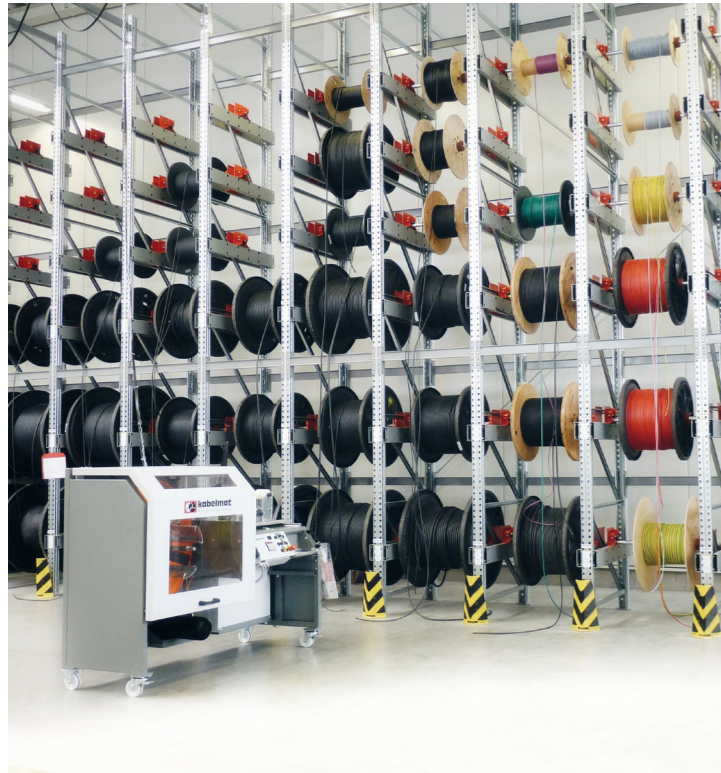
Fig. 1 LAGROL

Whether cable drum racks, cable ring storages or unwinding systems are needed - Kabelmat provides the right solution for your cable storage.